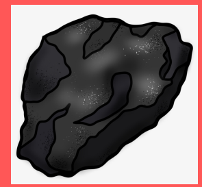
We use coal to keep fires burning!