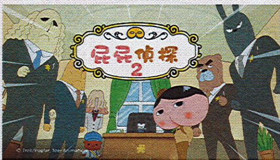
▲ Butt Detective