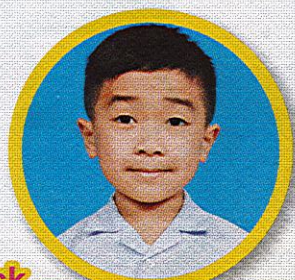
Rick S.K.H. Yan Laap Memorial Primary School