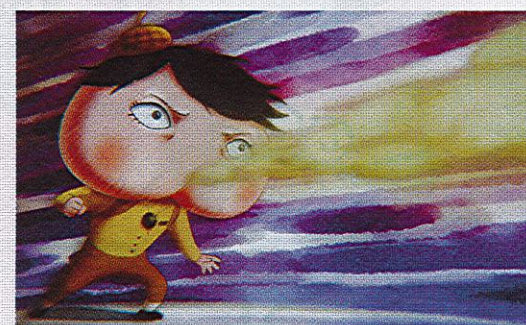
Answers on P12